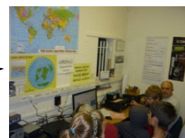
One of the Amateur Radio Rooms (connecting the world by radio)

Westgate Science Club visit to the NORMAN LOCKYER OBSERVATORY Sidmouth