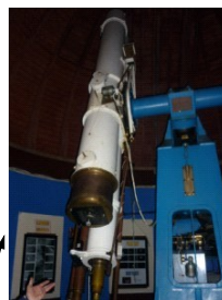
One of a number of telescopes. The Planetarium

WESTGATE SCIENCE CLUB ACID AMMONIA POTASSIUM GRAPHITE BORIC ZINC SODIUM COPPER CHALK SUGAR MAGNESIUM SULPHATE LEAD CALCIUM SODA LIME WATER ALUM MERCURY SALT NICKEL OXIDE PHENOL FERROUS CARBONATE BASE